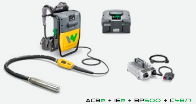
ACBe + IEe + BP500 + C4B/7