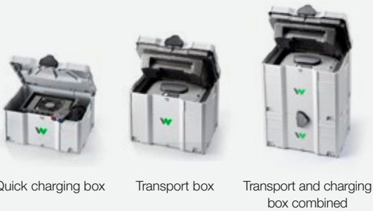
Quick charging box

For the battery of our internal vibrator system ACBe, practical transport and charging boxes from the Systainer brand are available. They give protection from soiling and damage.